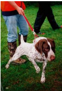
Scout Mosher anxious for his turn at the birds! (6 months old)