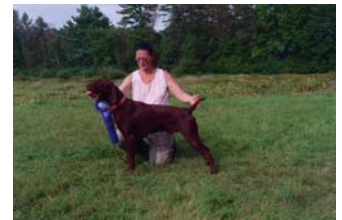
INTERMEDIATE LEVEL "SPENCER" BEAR MT BLUE RIDGE ECLIPSE, JH C/O - B DESJARDINS B/O/H - D BROAD