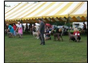
The Breed Line up