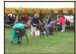
The Puppy Line up