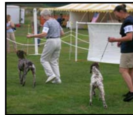
TWO VETERANS WITH TWO VETERANS