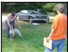
Lulu with two eyes on the birdfield instead of the ring.