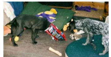
"What's in the bag?" "and where did your head go?"