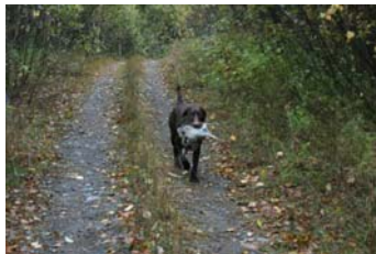
Am Can CH BIS CFC CH HHH Jam On The Brakes CHIC aka Jammer Retrieving a Ruffed Grouse in Northern Ontario October 2009