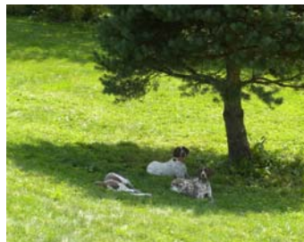
We see its a rough life living at Lou and Peg's! "The shade tree group"

HERE'S ONE OF OUR RECENT LITTER OF CHAMPION QUAIL - THAT'S "BUFFY" AND "WANDA" IN THE PICTURE STROLLING THROUGH THE NEIGHBORHOOD WITH THE PROUD DAM (CH BUFFERDINGLE'S LOW HANGING DRIPPYTUSHY) AND SIRE (VC VON SPIKEM'S RIGID RODDENDANGLE). FLIGHT-READY CHAMPION BLOODLINED QUAIL READY TO GO NOV 3D, CONTACT STEVE & PAULINE MARCQ.