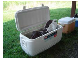
"Rudy" Russell/Newcomb the "Cool"er Dog