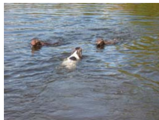
Wait.....Wait!! "I think I'm going the wrong way for that retrieve!!"